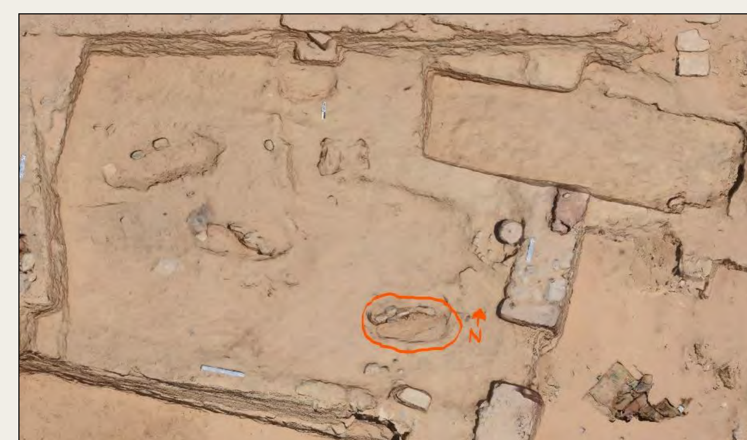
Figure 3: 3D Rendering of A:5-5/6-5 with L5337 (Orange Circle)