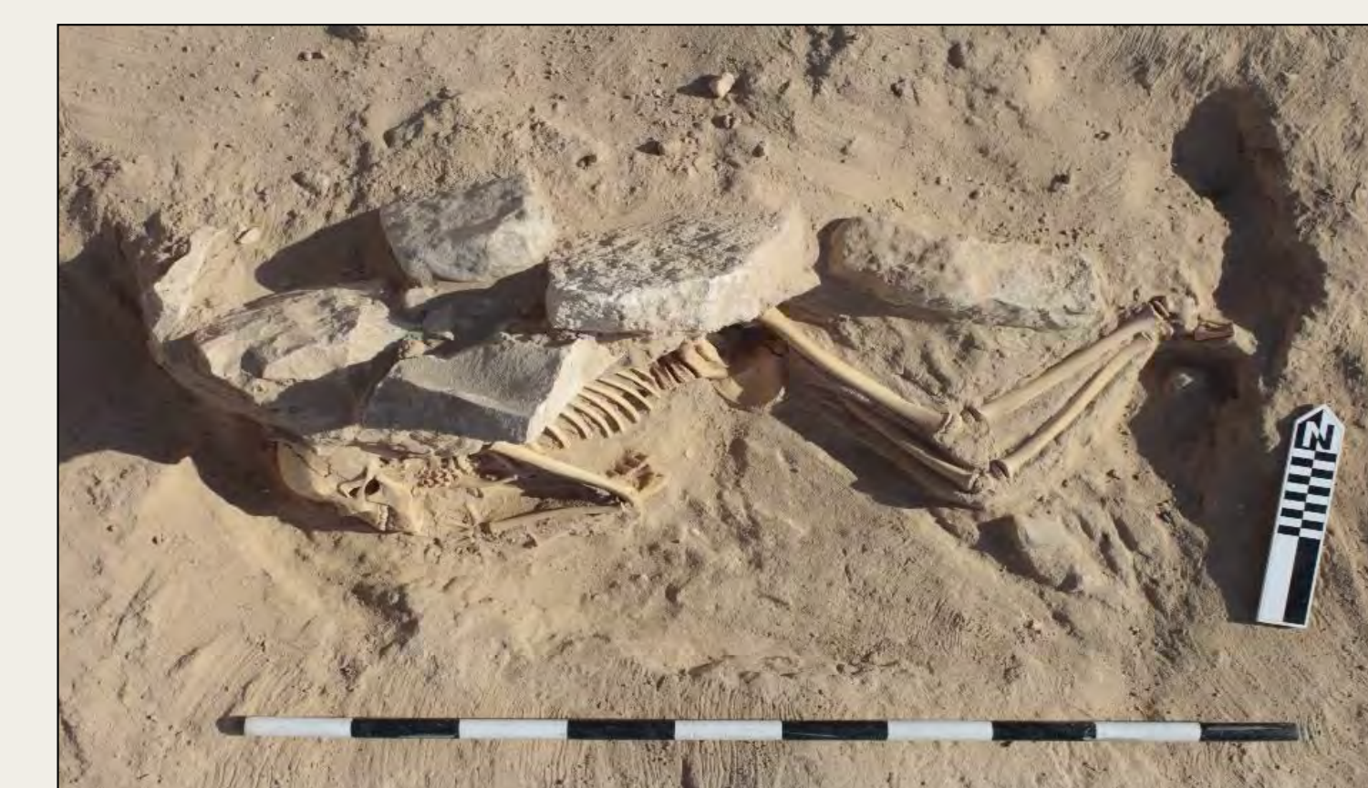
Figure 4: Photograph of Partially Excavated Contents of L5337