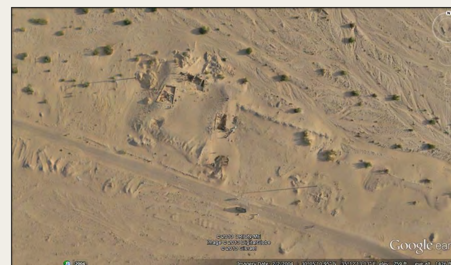
Figure 1: Satellite Image of 'Ayn Gharandal Excavation Site

Research generously supported by: The American Center for Oriental Research (ACOR), the Jordanian Department of Antiquities, University of Tennessee Department of Religious Studies (Departmental Travel Scholarship, 2019), as well as the Center for International Education (CIE Study Abroad Scholarship, 2019), and the Office of Undergraduate Research. The author would like to express a special thank you to the UTK Dig Jordan program for making this undergraduate research possible, and the Bedul Bedouin of Ar-Risha for being wonderful and welcoming hosts.