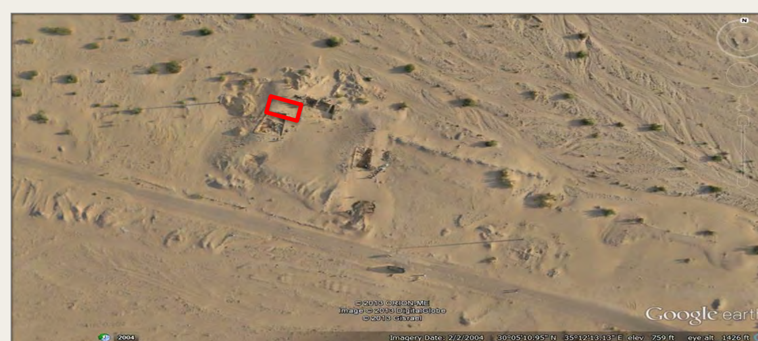
Fig. 2: Photogrammetrical Orthomosaic of 'Ayn Gharandal, showing location of A:5-5/6-5

In general, the bones were well preserved apart from the skull, which was crushed, possibly post-burial and pre-excavation. The left femur had been moved from the original context; it was dislocated and had rolled forward which may have occurred during decomposition or excavation. The remains presented with a broken coccyx and moderate arthritis was present in most joints. A significant amount of human hair was preserved on and around the skeleton, along with decomposition tissue, a sample of which was collected for carbon dating. One small unidentified find was collected in association with this inhumation. Ceramic sherds were also collected in this locus, but these pieces do not appear to be associated with this burial and were likely deposited into the grave along with the fill within the cist cut.