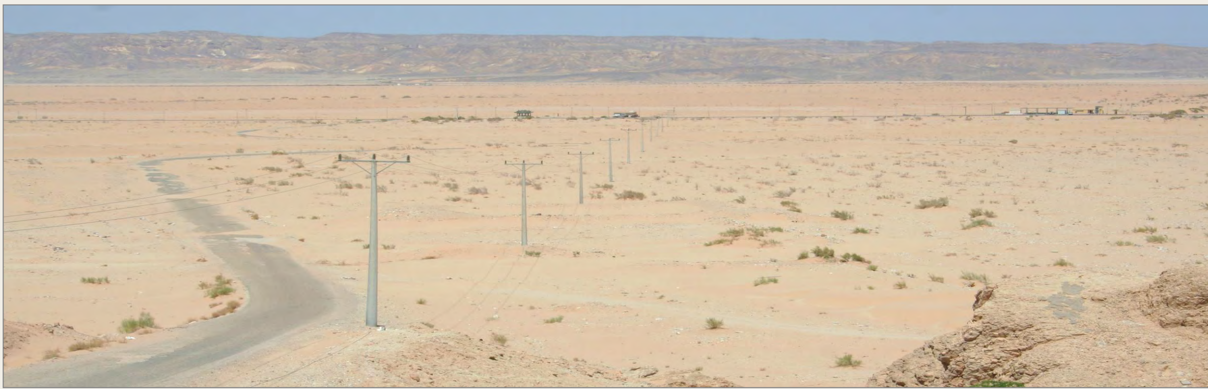
Fig. 1: Overlooking the site of 'Ayn Gharandal, facing W