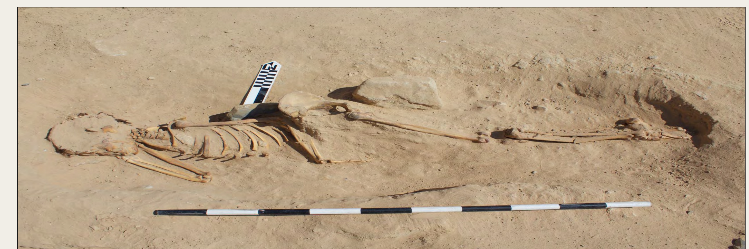
Fig. 5: Photograph of Inhumation 5335, post-articulation, facing N

Based on osteological analysis the skeletal remains in L5335 likely represent a female that was twenty to twenty-nine years of age at the time of death. Further analysis of skeletal dentition showed evidence of nutritional stress, likely from nutritional challenges in childhood. Several skeletal remains found during previous seasons were carbon tested and returned a date range between 1190 and 1340 CE. Based on the C14 dates and the similarities found in Inhumation 5335 it is likely that the individual interred in L5335 also was buried during the Middle Islamic period.